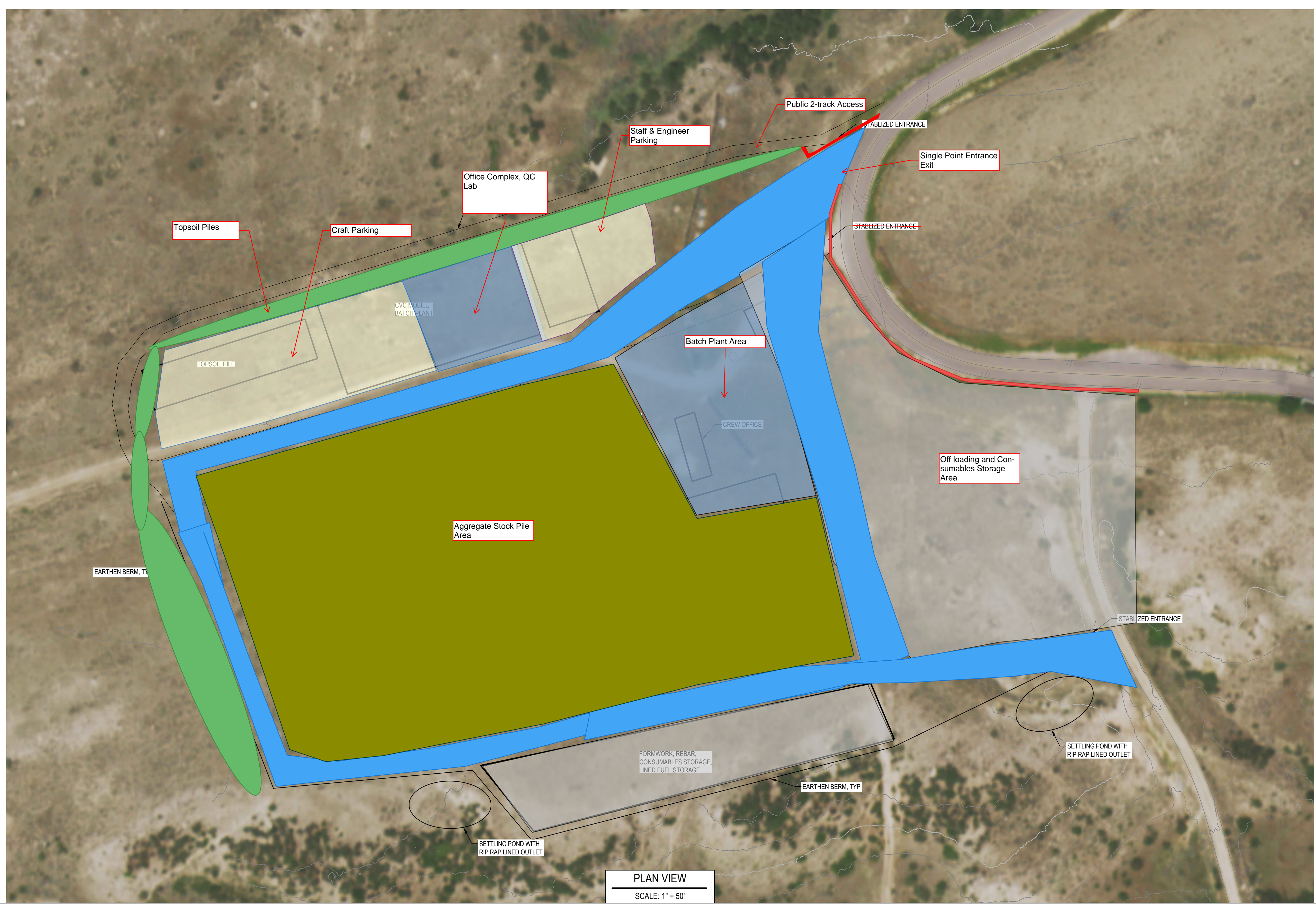
PLAN VIEW SCALE: 1" = 50'

GENERAL NOTES 1. LIMITS OF LAY DOWN AREAS AND BUILDINGS ARE APPROXIMATE.